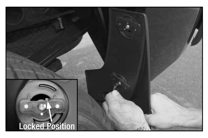
While holding the MudFlap in place, use the hex key provided to tighten the lower QuickTurn™ fastener. The indicator (on the fastener) will rotate 90° to the locked position (indicated by padlock), continue rotating the hex head bolt until the MudFlap is tightly clamped to the fender lip (the bolt will have some resistance to turning).