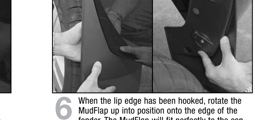
fender. The MudFlap will fit perfectly to the contour of the fender.