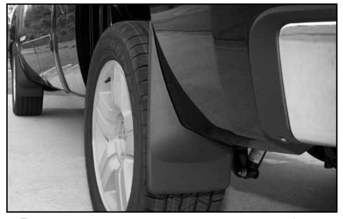
Begin passenger side installation by identifying the MudFlap marked "RH". Repeat steps 3-8.