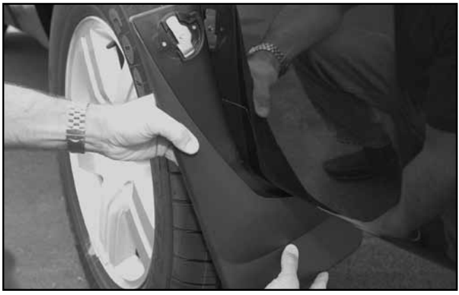
While holding the MudFlap at approximately 45° from vertical (shown), hook the plastic tab on the MudFlap around the inside corner of the fender lip.