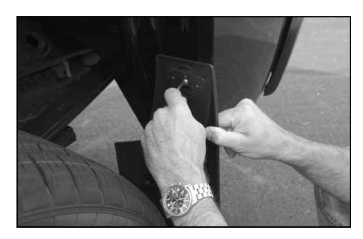
While continuing to hold the MudFlap in place, tighten the upper QuickTurn™ fastener. The indicator (on the fastener) will again rotate 90° to the locked position. Continue rotating the hex head bolt until the MudFlap is tightly clamped to the fender lip.