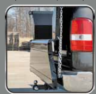
Double Pivoting Tailgate (Steel/SS & Poly Models)