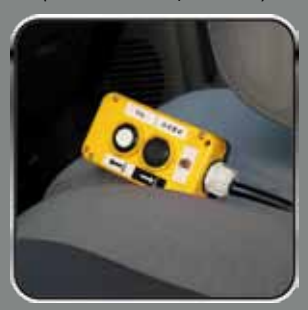
Tethered Control Box (Steel/SS & Poly Models)