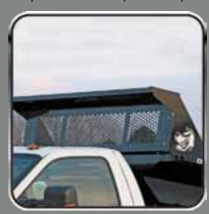
Optional Bolt-On Cab Guard (Steel/SS Models Only)