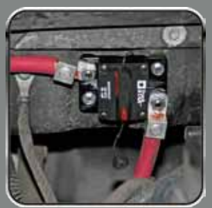
Circuit Breaker (Steel/SS & Poly Models)