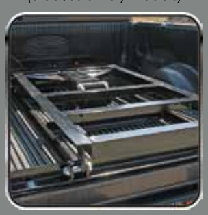
Structural Steel Frame (Steel/SS & Poly Models)