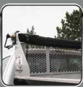
Optional Tarp Kits (Steel/SS & Poly Models)