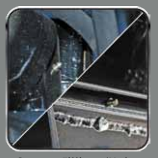
Grease Fittings/Holes (Steel/SS & Poly Models)