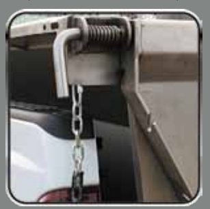
3/4" Dia. Tailgate Hinge Pins (Steel/SS & Poly Models)