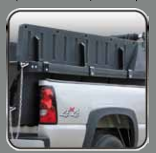
Optional Poly Wall Extensions (Poly Model Only)