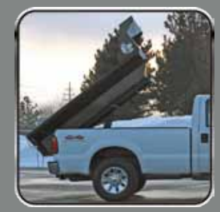
0° - 45° Dump Angle (Steel/SS & Poly Models)