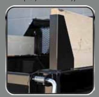
Optional Wall Extension Bracket Kit