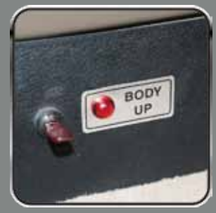
Body-Up Indicator Kit (Steel/SS & Poly Models)