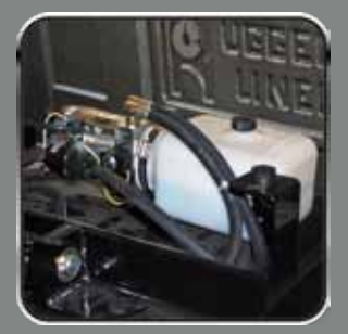
Motor & Hydraulic Pump (Steel/SS & Poly Models)